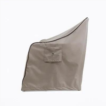
Rain Cover With Rain Cover