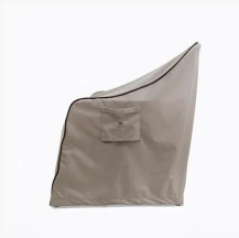
Rain Cover With Rain Cover