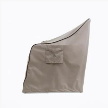
Rain Cover With Rain Cover